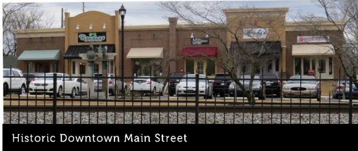
Historic Downtown Main Street